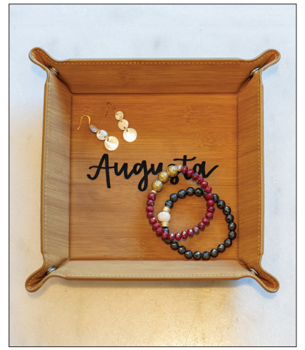
Augusta Valet Tray For the dresser or desk, these handsome leather valet trays are embossed with "Augusta" in the center. Small, $24.50; large, $28.50