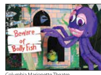
Columbia Marionette Theatre