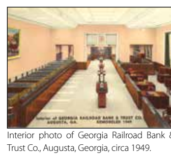
Interior photo of Georgia Railroad Bank & Trust Co., Augusta, Georgia, circa 1949.

Friday, April 13 Noon. Films on Friday: The Grass Harp (1995). This comedy-drama, based on the novella by Truman Capote, stars Piper Laurie, Sissy Spacek, Walter Matthau and Nell Carter as the eccentrics who populate a small Alabama town as well as the life of Collin Fenwick (Edward Furlong), a youth who is sent there to live with his maiden aunts. Participants are invited to bring a lunch. FREE.