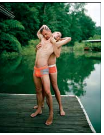
Jill Frank, Couple on Dock , 2013. Archival jet print.