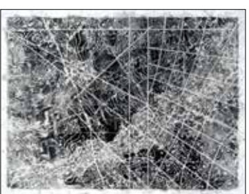
Cheryl Goldsleger, Navigation , 2015. Graphite, mixed media on Dura-Lar.