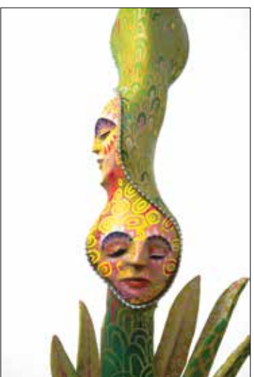
Greg Carter, Spring Sprouts the Vetchlings (detail), 2013–2015. Mixed media. Soulfire Photography 2015.